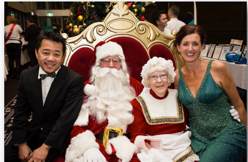
Santa and Mrs Claus post with guests at the 2019 Christmas in July Charity Ball